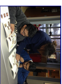
Members receiving homework help