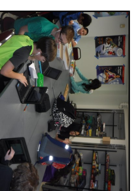
*Wi-Fi access for homework

Groups are designed to educate and encourage youth to make decisions that promote healthy lifestyles.