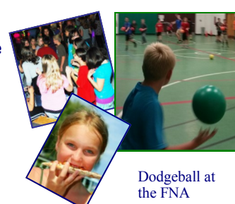
Dodgeball at the FNA

Dancing, Pizza, Dodgeball, Karaoke and more Open to all Township students in grades 6-8 www.wtyouthservices.com/fna-events